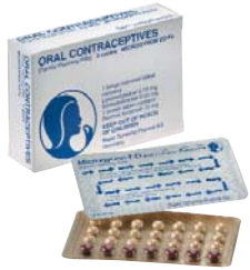
Oral contraceptive: Pills Microgynon 30 ED FE®