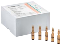
1 monthly / 3 monthly Injection Noristerat®